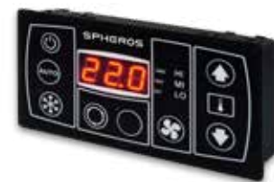
Functional, robust and easy to operate