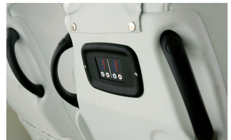
Individual air conditioning control: a joy for the passenger

For us and our customers this sophisticated form of thermal management is the most important task of a state-of-the-art bus air condition system – today and in the future.