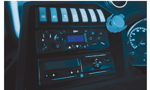
SC 1000 – integral control unit at the driver’s seat – for worldwide use.

Valeo has been continuously stepping up its commitment in this sector and is resolutely positioning itself as a development and system partner for vehicle electronics and complete control in buses worldwide.